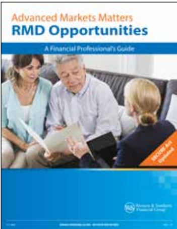
RMD Opportunities CF-27-68008