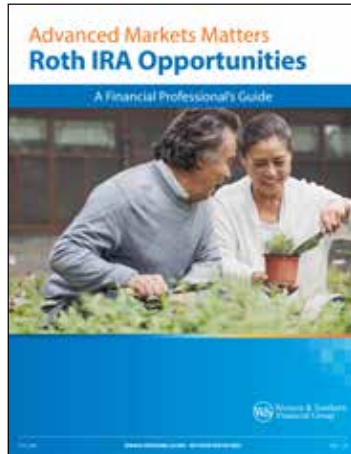
Roth IRA Opportunities CF-81-23000

Get Yours Today from Your Regional Representative