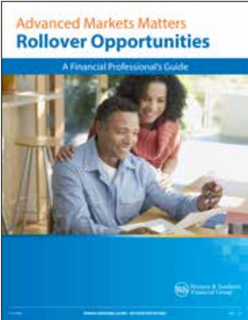
Rollover Opportunities CF-76-50000