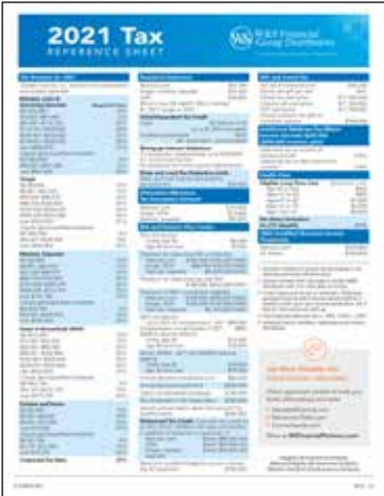
Tax Reference Guide CF-24-0001A